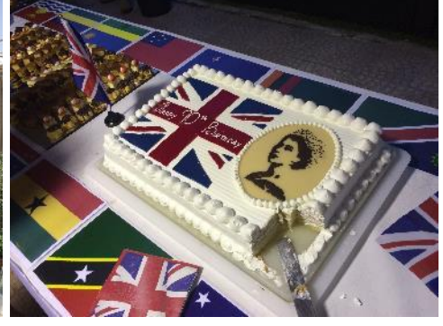
Queen's b'day (she didn't even show up!)