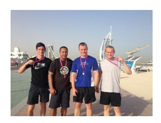
Mother's day fun run at the beach