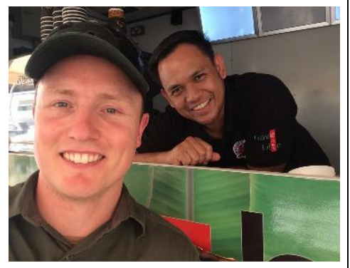
Rey at work on the base