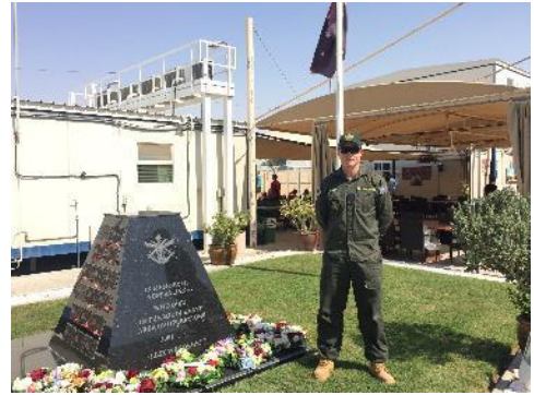
ANZAC day at the memorial