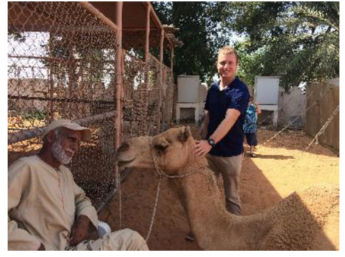
At the Heritage Village on a cultural tour