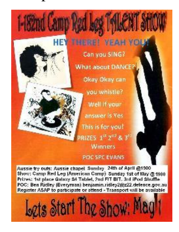
U.S. Talent show I performed my song at