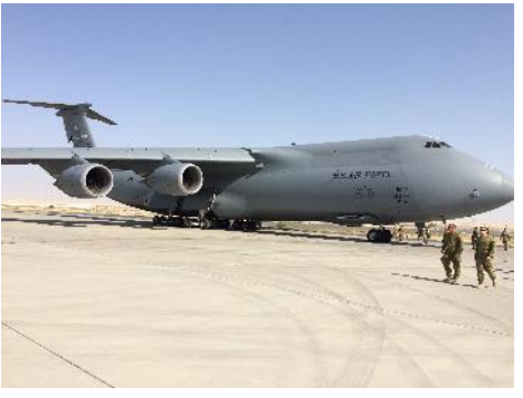
USAF C-5 Cargo Jet visit