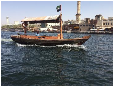
Dubai cultural tour in 'Old Dubai'