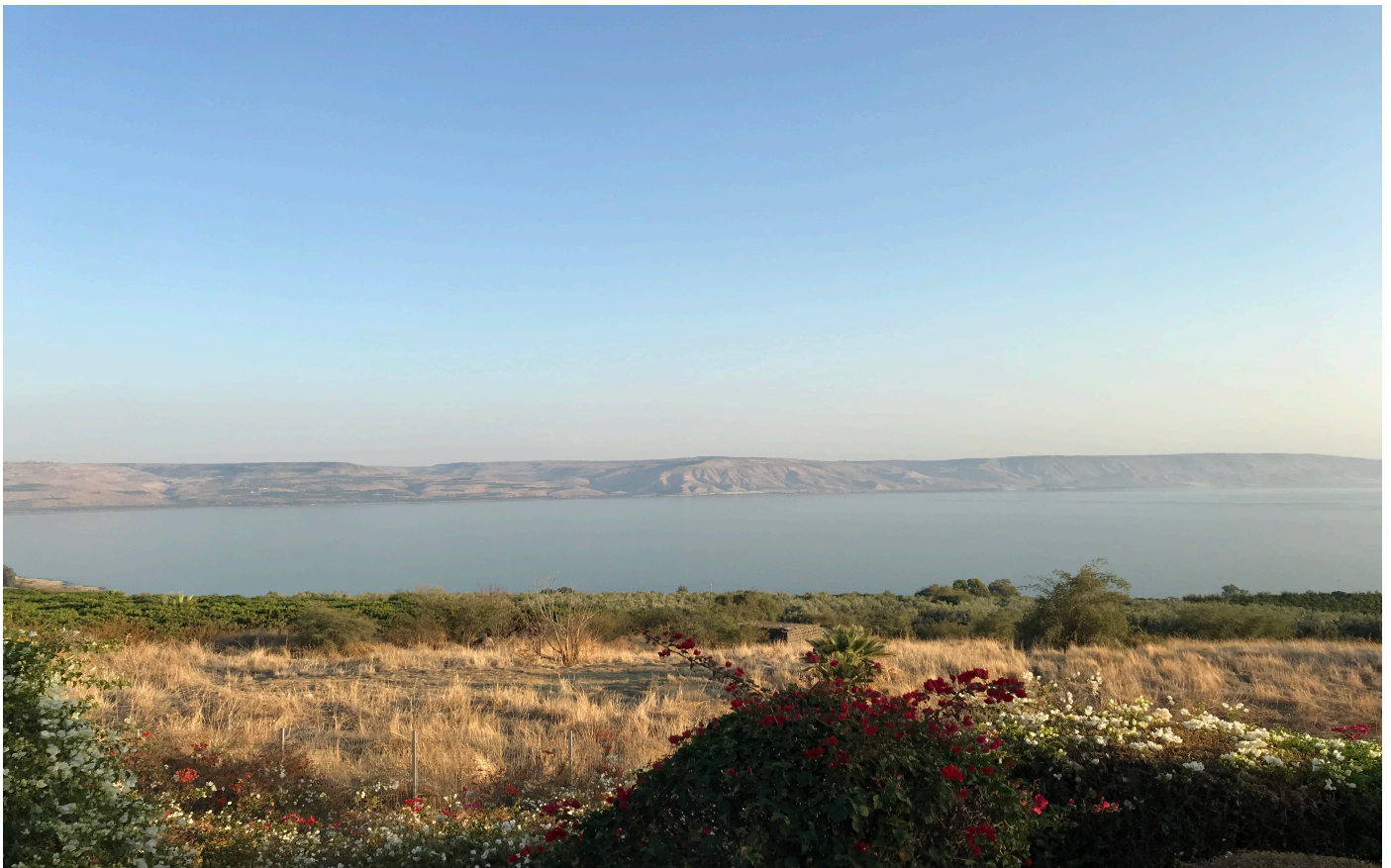
Sea of Galilee (This was very close to where our Lord gave the greatest sermon ever preached on New Covent living)

31 “Behold, days are coming,” declares the Lord, “when I will make a new covenant with the house of Israel and with the house of Judah, 32 not like the covenant which I made with their fathers in the day I took them by the hand to bring them out of the land of Egypt, My covenant which they broke, although I was a husband to them,” declares the Lord. 33 “But this is the covenant which I will make with the house of Israel after those days,” declares the Lord, “I will put My law within them and on their heart I will write it; and I will be their God, and they shall be My people. 34 They will not teach again, each man his neighbor and each man his brother, saying, ‘Know the Lord,’ for they will all know Me, from the least of them to the greatest of them,” declares the Lord, “for I will forgive their iniquity, and their sin I will remember no more.” (NASB)