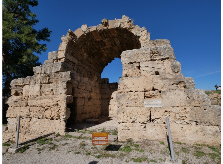
An Early Church in Corinth

stones to the Master Builder so that He can build us together into a dwelling place that is pleasing to Him (1 Pet. 2:4-10). How do we present ourselves as living stones to Him? The answer is in Acts 2:42. We continue steadfast in the Apostles’ doctrine, in fellowship, in the breaking of bread and in prayer (Ac. 2:42). These four things is what we do to build the Church and the Holy Spirit through the gift of prophecy will exhort us to not neglect these four things.